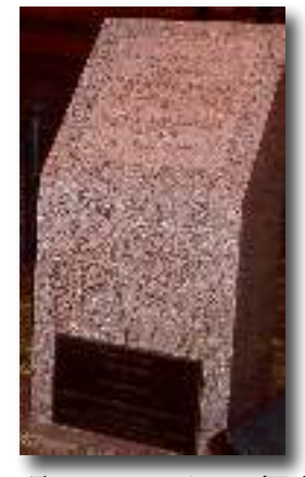
The monument to RaymondWeeks across from Boutwell Auditorium, dedicated 1989, with 60th Anniversary Commemorative Plaque added in 2007.