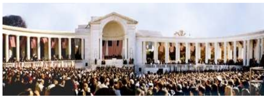
Veterans Day Ceremony at Arlington National Cemetery

Alabama applauds leaders of Kansas and other cities and states who joined the movement and took action to make Veterans Day part of the fabric of America. After Birmingham hosted America's first national Veterans Day celebration in 1947, expanding the purpose and scope of Armistice Day, celebrations take place in communities across the U.S.A., including a major program in our nation's capital.